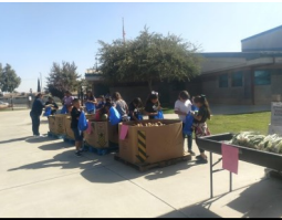
Students in line for fresh produce.