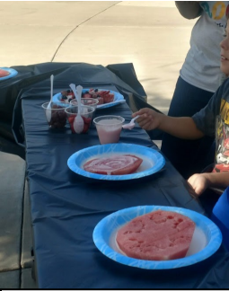
Student making his delicious watermelon pizza.

UC CalFresh of Tulare County has joined efforts with Alila Elementary, FoodLink, United Health Centers of San Joaquin Valley, and CHOICES After School Program to revive the Healthy School Farmer's Market.