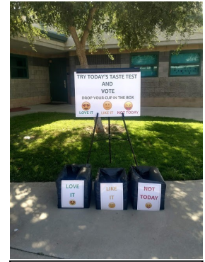
Students taste tested a pasta salad where they decided if they loved, liked, or not today.

As a result, 100 students from the CHOICES After School Program and about 80 members of the community took home a bag of fresh produce. FoodLink supplied watermelon, spinach, tomatoes, green onions, and pears. UC CalFresh provided students with a delicious pasta salad taste test where students voted if they loved, liked, or not today. The results indicated that 102 students loved it, 29 students liked it, and 19 students not today. In addition, The United Health Center of San Joaquin Valley provided students with water bottles, hand sanitizer and pill organizers. UC CalFresh is excited to be a part of a team that is encouraging healthy eating in the community of Earlimart.